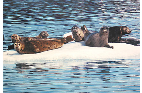
Harbor seals ( Phoca vitulina ) like to rest and bear their young on icebergs near the face of tidewater glaciers in Aialik Bay. Environmental change and increasing vessel traffic may be affecting their habitat.

Aialik Bay is one of a few glacial sites suitable for in-depth studies of harbor seals. Seals in Aialik Bay primarily rest on glacier ice calved from Aialik, Pederson, and Holgate glaciers and rarely haul out on land. Remotely-controlled video cameras, located on Squab Island and near Pederson Glacier, transmit images of seals and their habitat via microwave to researchers at the Alaska SeaLife Center. During summer months, the cameras provide a nearly round-the-clock view of harbor seal numbers and distribution, presence or absence of human activity, and changes in iceberg distribution and availability. Analysis of these factors could shed important light on why harbor seal populations are not recovering in Aialik Bay and could even have implications for the entire Gulf of Alaska population. Another important outcome could be recommendations for how to minimize disturbance by vessel traffic while maximizing viewing opportunities for visitors.